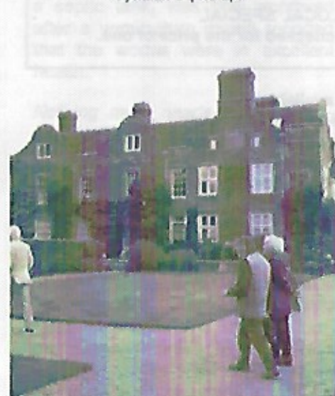
Just a little stroll before tea