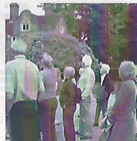
Now are you paying attention?