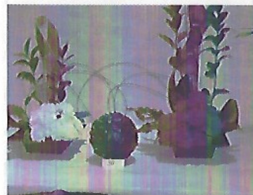
1972 'First heart Transplant'