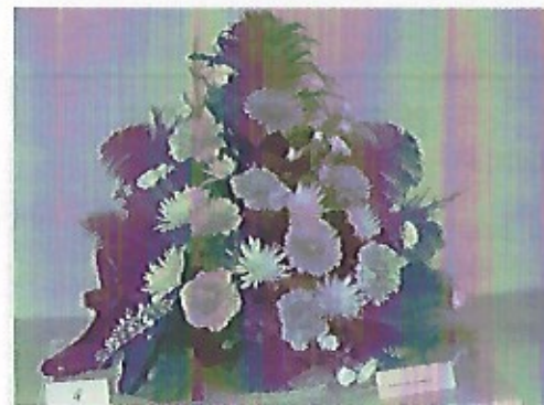
1908 "Tiller Girls dance on London Stage"