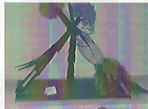
1913 "Foxtrot sweeps the Country"