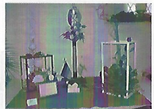
1966 "The World Cup – England 4 Germany 2"