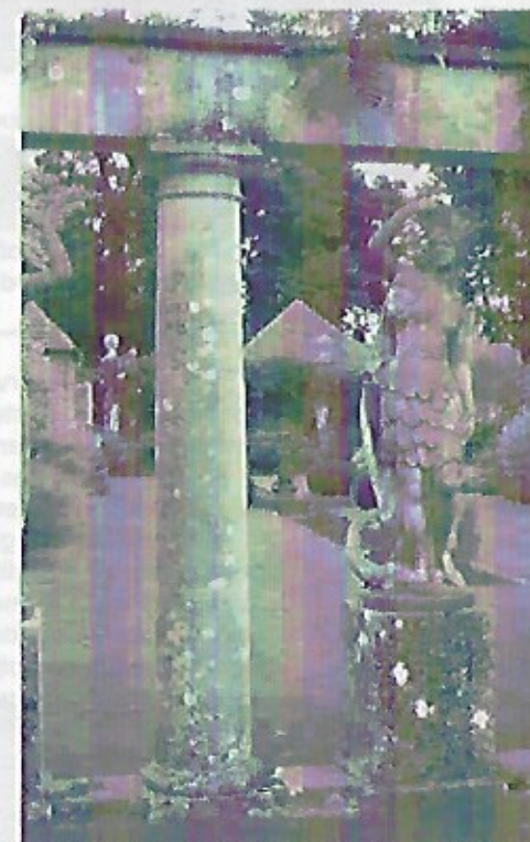
Just like mine at home!