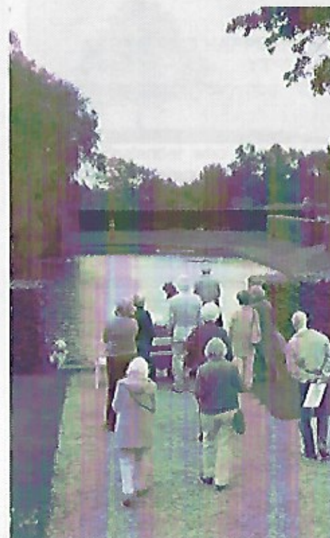
Anyone for a quick dip?

Thank you to all who donated and supported this very worthwhile event and to those who worked so hard on the evening running it.