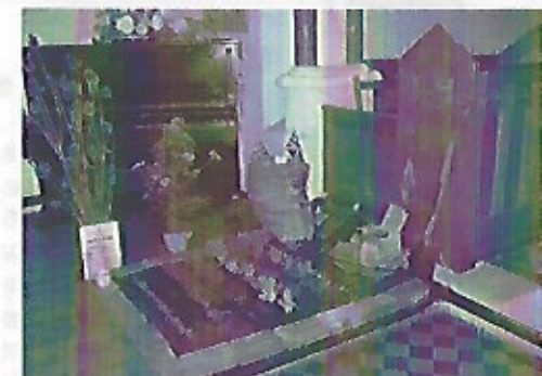
1940 'Dig for Victory'