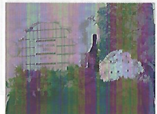
2000 The Millenium