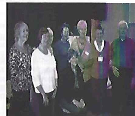
High Sheriff seated with MOPPs helpers